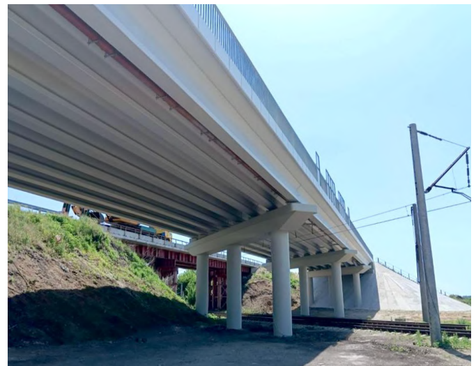
Restoration of a bridge in the Kharkiv region

*As of July 19th, 2024, according to regional military administrations since February 24th, 2022