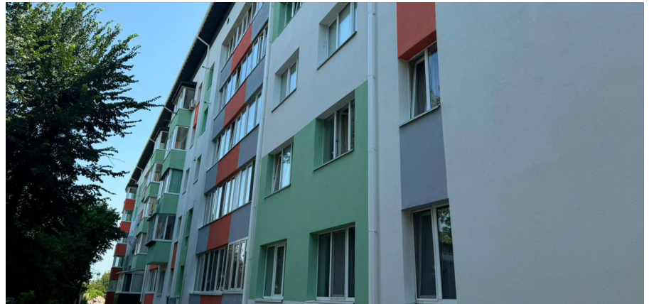
Restoration of an apartment building in Makariv, the Kyiv region